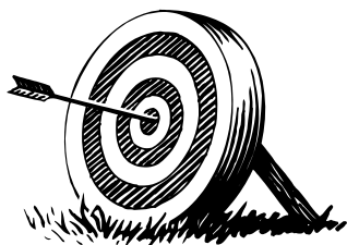
BRONCOS "ON TARGET" ARCHERY TEAM

This Project is for 5-8 year olds Enrolled in the Broncos 4-H Club Clover Bud Archery Participants Limited to 5 per year